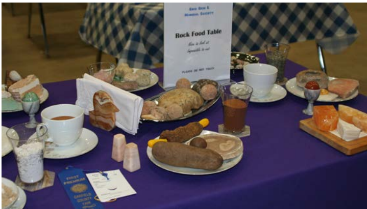
1st place - EGMS "food" table - 2013 Garfield County Fair

Fair Setup: Stan Nowak volunteered to be in charge of the booth and getting it set up and scheduling workers. Mary Walters volunteered to be in charge of getting the "Food Table" set up. Wednesday, September 4 at 1:00 PM is the set up time.