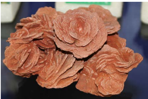
This specimen belongs to an EGMS member and shows what everyone hopes to find!