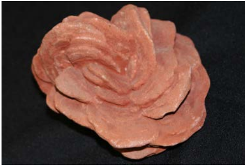
Specimen of an EGMS member.

A rose is a rose by any other name MIGHT be a rose rock!? No doubt this rose, without thorns or sweet scent, is every bit as beautiful to a rock hound as any flower could be! It also has a much longer 'shelf life' and can be used to decorate with in many ways with an artist's eye. Coming in a variety of earthy shades and sizes, it's a great rock to add to a collection.