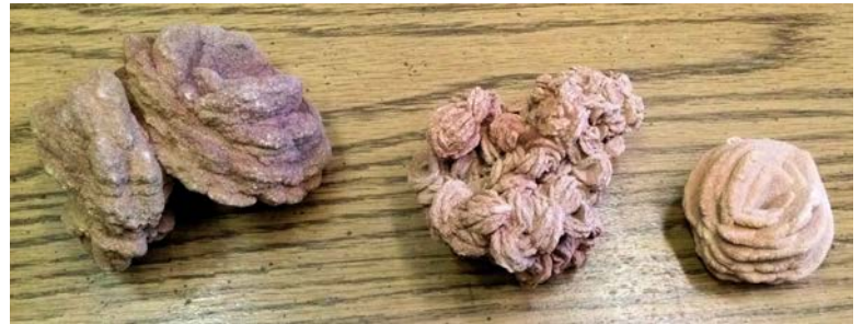
Found on the 8-16-14 field trip to Lake Stanley Draper.

We started out finding rocks along the lake roads, what are called walnuts and a few small roses. Then we progressed to the water's edge finding large clusters and larger roses just rolling up with the waves. We all made our way to a point on the lake that Stan had picked out for us to hunt at. The amount of rocks for the 'picking' was incredible and we actually started getting a little picky about what we picked up! After staying for a couple of hours, we parted ways with Stan, the Rogges and the Wordens who were going to the Rose Rock Museum at Noble, OK and with the Haackes and the Marneys who were going back home to Enid.