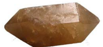
Pecos Diamond

Over 50 dealers selling everything from amethyst cathedrals to Zebra rock, rocks and minerals inexpensive to moderately priced. You'll find gems (crystals, faceted, cabs, rough, and set in jewelry), decorator items and jewelry, books and supplies, beads and lots more. We'll have a mineral ID Booth, educational booth - NM Bureau of Geology and