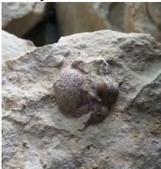
natural, not prepped Phacopod trilobite