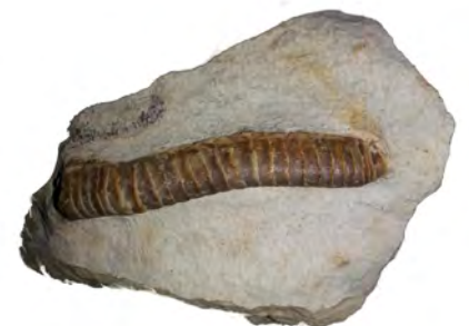
Machaeridian armoured worm