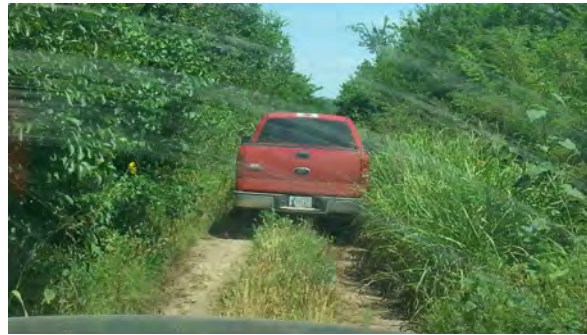
Traveling on Black Cat Mountain!