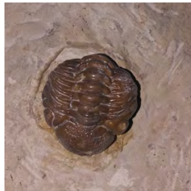
prepped Phacopod trilobite