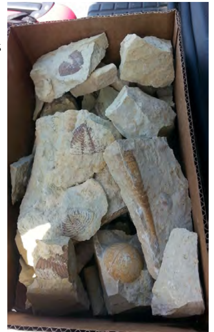
Huntoniatonia pygidiums (tails)